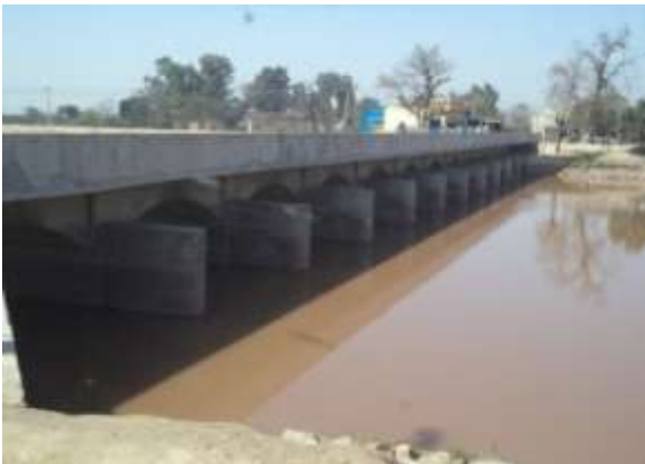
Photograph No. 3: View of newly constructed bridge at LBDC main canal (ICB-01)