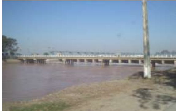
Photograph No. 2: Picture showing the Balloki Barrage (BB/ICB-01).