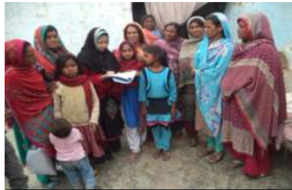
Photograph No. 10: A view of on-site consultation with women at Jajakalan (ICB-01).