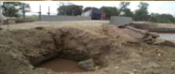
Photograph No. 5: View of vulnerable trench at ICB-06 (B) Mauza Sawarpur 91 -10/R tehsil & district Khanewal, which requires to be filled.