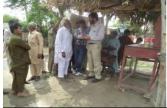
Photograph No. 8: A view of on-site validation of paid APs at 59-15/L, Tehsil Mian Channu, District Khanewal.