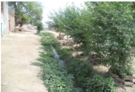
Photograph No.11: A view of tail reach (upgraded) of NCB-01 at Fatehpur Sharif, District Okara.