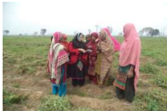
Photograph No. 12: A view of on-site consultation with women at village 27-GD (ICB-04), District Okara