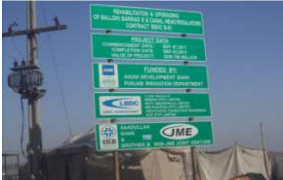
Photograph No. 1: View of the Project description at a glance displayed at Balloki Barrage (BB/ICB-01)