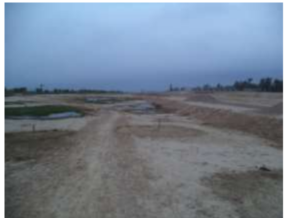
Photograph No. 6: Affected land needs restoration at pre-project condition at ICB-02 60- 4/ R, District Sahiwal.