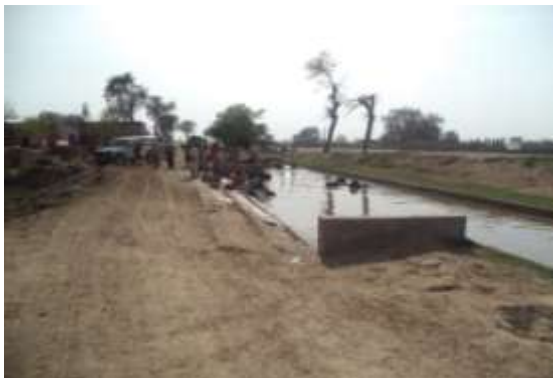
Photograph No. 9: A view newly constructed cattle ghat in village (Pul Aroraywala, Tehsil Okara, NCB-01), where there is risk for children from crowd of animals; such structures should be about 300 m away from village.