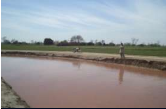
Photograph No. 7: A picture showing one of the AP who have been paid compensation for temporary land occupation during construction of diversion channel.