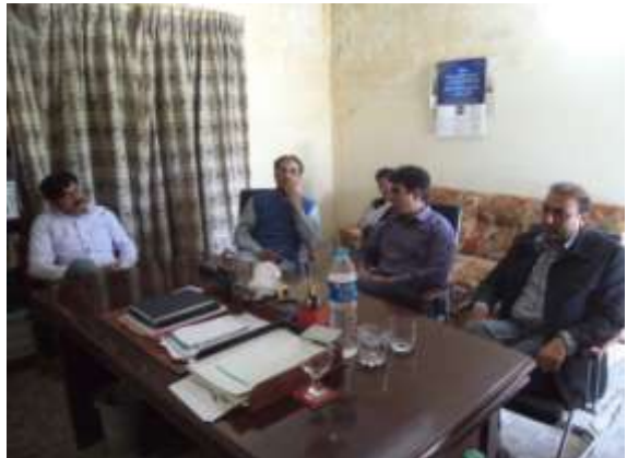
Photograph No. 4: A consultative meeting with Contractor (SPARCO) representative at Sahiwal (ICB-02).